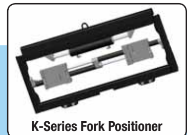
K-Series Fork Positioner