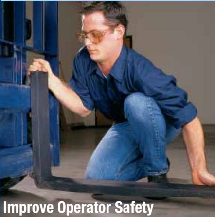
Improve Operator Safety